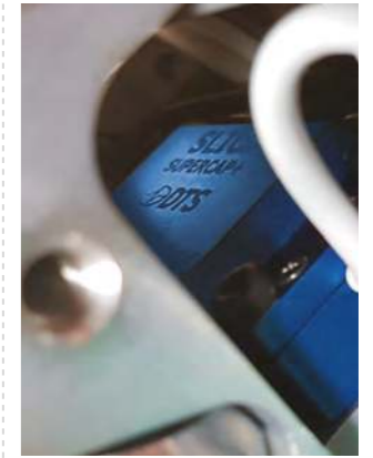
ABOVE: The integrated Slice Nano DAQ includes a quick-charging supercapacitor to ensure data capture

“Current users who have a Flex PLI with Slice Nano can swap systems between an aPLI and Flex PLI,” explains James French, project engineer at Cellbond. “This not only offers the advantage of having spares in stock, it also allows the extra data acquisition channels, connectors and