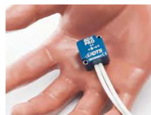
ABOVE AND LEFT: The standard configuration for the new aPLI includes 18 channels of DTS Slice Nano DAQ and a 6DX Pro sensor package (triaxial angular rate and triaxial accelerometer) in the upper-body mass, along with a single-axis ARS Pro angular rate sensor in the knee